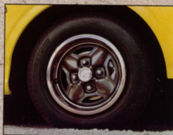
All models come with steel-belted radial tires and styled steel wheels.

SR-5 and Deluxe. Like all Corollas, they're both equipped with quality features like MacPherson strut front suspension, for good road handling. And power-assisted front disc brakes for sure stopping. Plus unitized body construction, with welds instead of bolts, to help