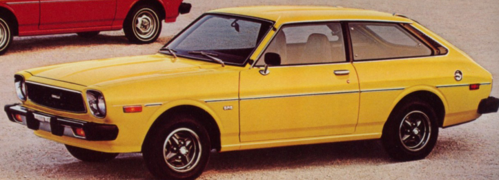
Corolla Liftback SR-5