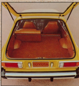
The Liftback's wide-opening rear door and fold-down split rear seat provide a cargo area that's spacious and versatile.

Corolla Liftback and Corolla Sport Coupe—two great new functional cars that are also fun to drive. They round out Toyota's quality line of Corollas.