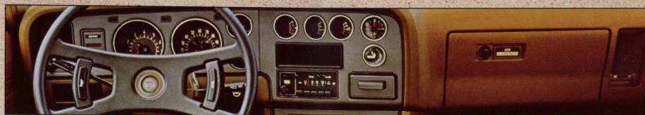
SR-5 models offer full instrumentation and a cockpit type dash to put all controls within easy reach.

Take the new Corolla Liftback, for example. We designed it to be stylishly sporty looking, and yet incredibly functional. It's a practical sedan with two doors, plus a wide-opening rear liftback that acts as a third door. The third door opens into a spacious cargo area that comes in handy for running errands, picnicking, camping, or any other