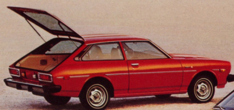
Corolla Liftback Deluxe