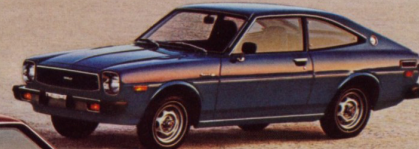
Corolla Sport Coupe Deluxe