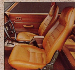
All Corollas have fully reclining Hi-back front bucket seats, adjustable to 120 different positions.

Plus More Corolla Standard Equipment. You'll be pleasantly surprised to learn most Corollas are equipped with other niceties that aren't often found as standard equipment on other cars. Such as fully reclining Hi-back front bucket seats, adjustable to 120 different positions. And an electric rear window defogger, nylon loop pile wall-to-wall carpeting and flip-out rear windows. Plus shiny chrome bumpers.