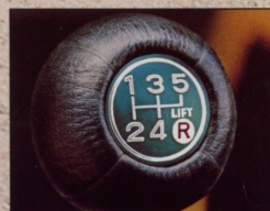
SR-5 models come standard equipped with a 5-speed overdrive transmission.

Inside the SR-5's, you'll find a cockpit type dash with console, plus full instrumentation to help you keep track of what's going on under the hood. There's an electric tachometer, so you always know how fast your engine's running. And gauges to keep you informed on things like oil temperature and pressure, and water temperature. Plus an ammeter, an