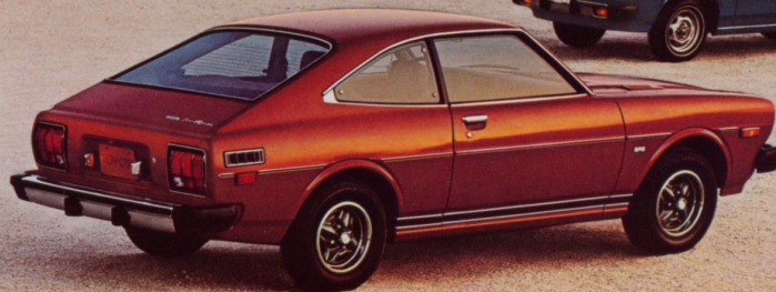
Corolla Sport Coupe SR-5